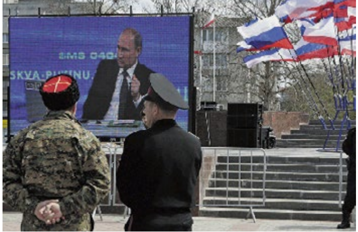
Cossacks watching a screen featuring Vladimir Putin in Simferopol, the capital of the Republic of Crimea, on April 2015.

when Russia occupies Moldavia and Wallachia, albeit only temporarily, that disturbs the balance of power. France occupies Rome and stays there several years in peacetime: 2 that is nothing; but Russia only thinks of occupying Constantinople, and the peace of Europe is threatened. The English declare war on the Chinese, 3 who have, it seems, offended them: no one has a right to intervene; but Russia is obliged to ask Europe for permission if it quarrels with its neighbour. England threatens Greece to support the false claims of a miserable Jew and burns its fleet: 4 that is a lawful action; but Russia demands a treaty to protect millions of Christians, and that is deemed to strengthen its position in the East at the expense of the balance of powers. We can expect nothing from the West but blind hatred and malice, which does not understand and does not want to understand ( comment in the margin by Nicholas I : “This is the whole point”).